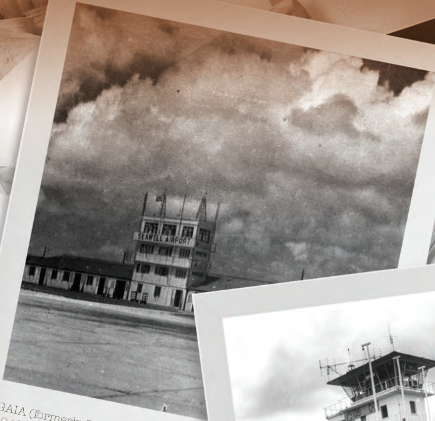
GAIA (formerly Seawell Airport) 1940's