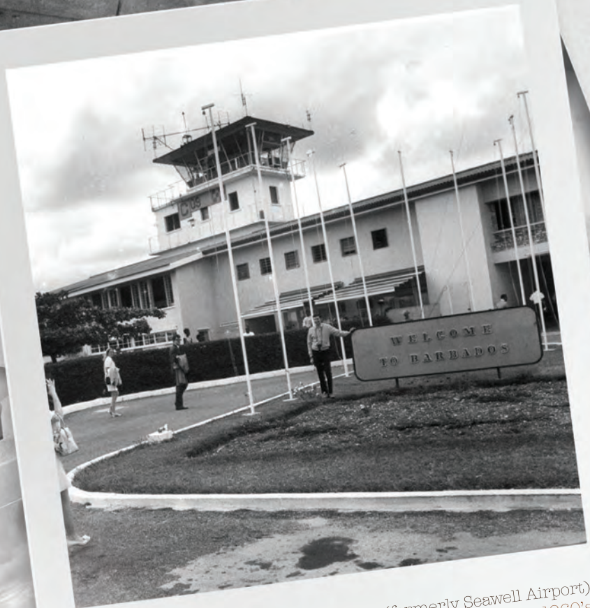
GAIA (formerly Seawell Airport) 1960's